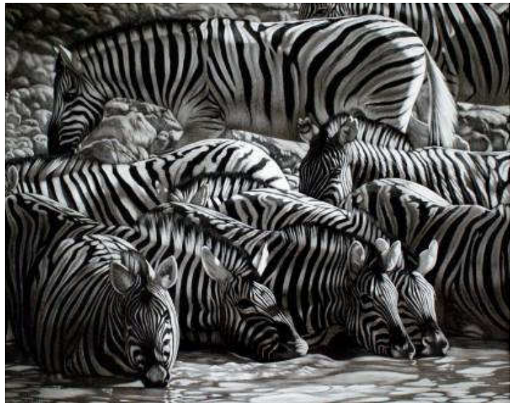
Life Blood of Etosha, scratchboard