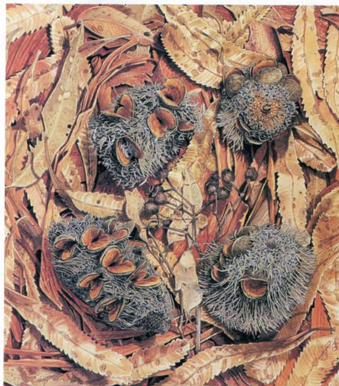
Highly Commended: Colleen Werner