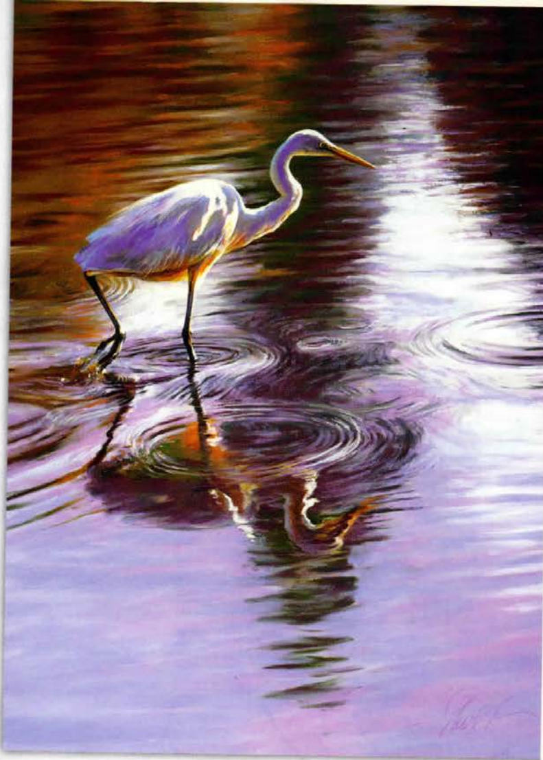
HIGHLY COMMENDED STEVE MORVELL, Just Passing Through - Great Egret