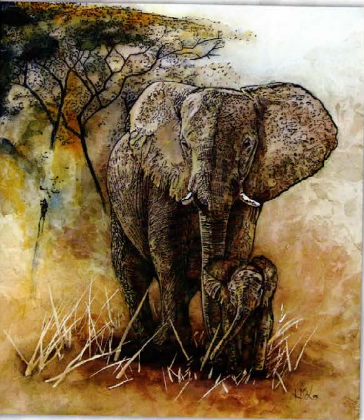
HIGHLY COMMENDED KARIN MCKEE, Shelter