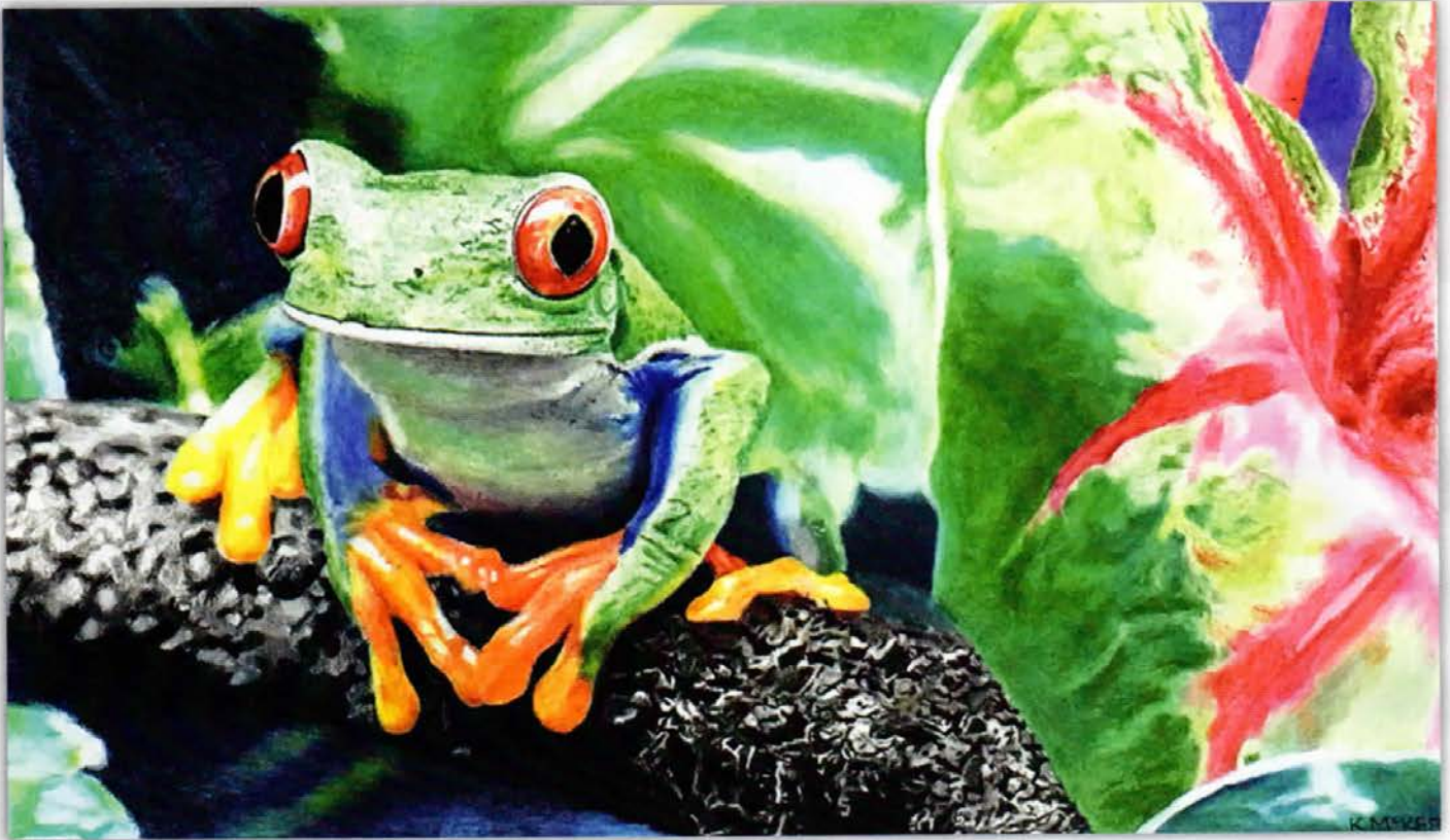
HIGHLY COMMENDED KARIN MCKEE, Green is the New Black