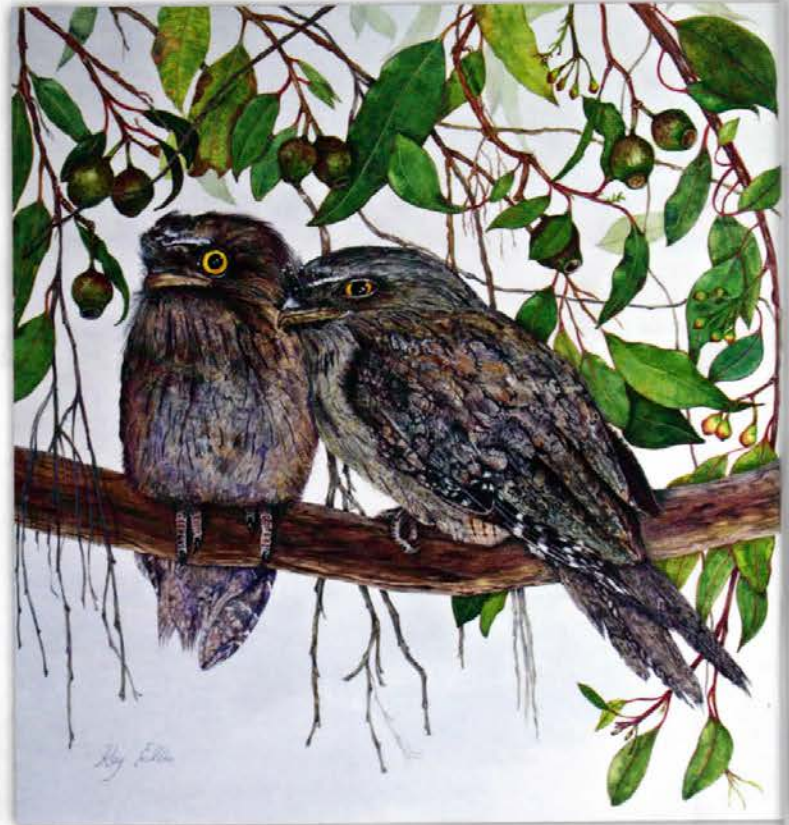
HIGHLY COMMENDED KAY ELLIS, Masters of Disguise