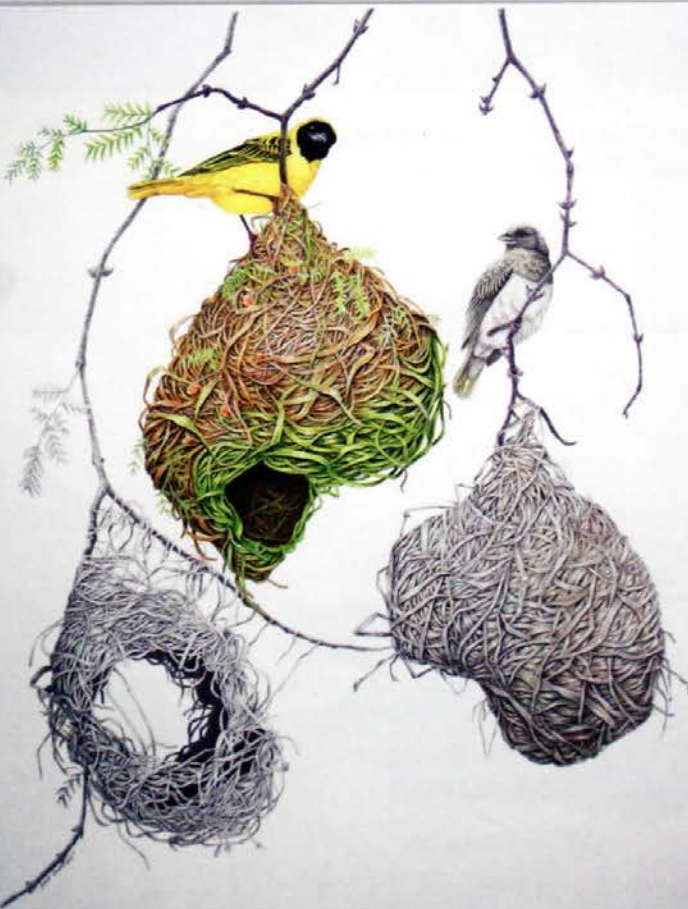
HIGHLY COMMENDED JANET MATTHEWS, House Proud